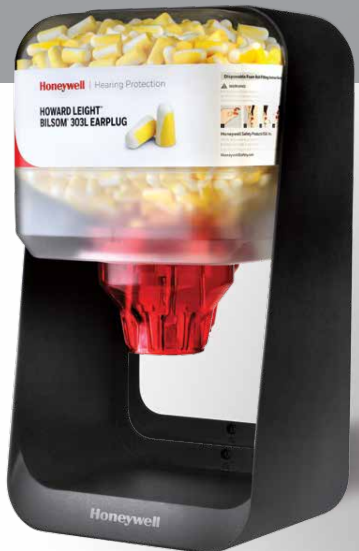
HL400-F Full Frame Robust design for high traffic