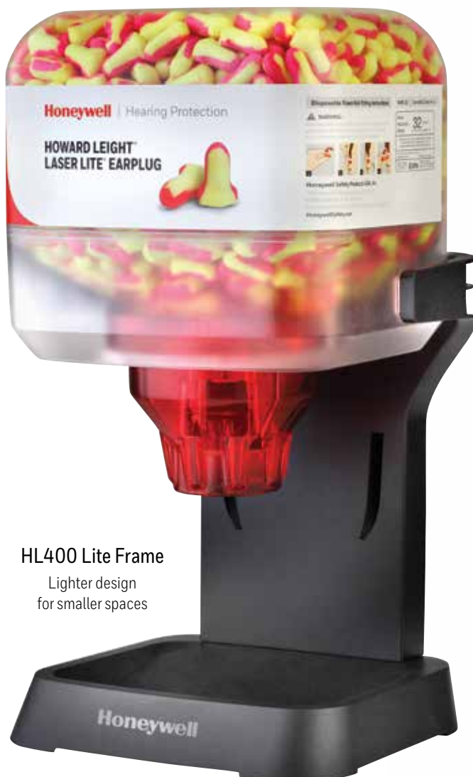
HL400 Lite Frame Lighter design for smaller spaces

Allow employees easy access to hearing protection – and make sure that the choices are specifically matched to the work environment. Place dispensers by the shop door or in the lunchroom, and employees can access a new pair of earplugs as they enter the workspace.